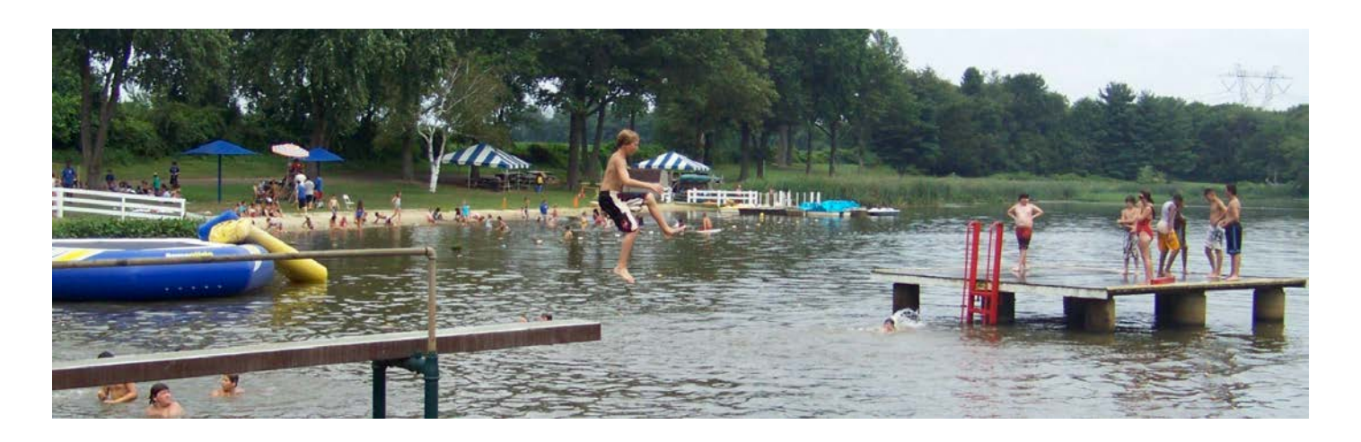
A quick reference of the people, places, traditions, and sayings that help make Liberty Lake the extraordinary world that we know and love!