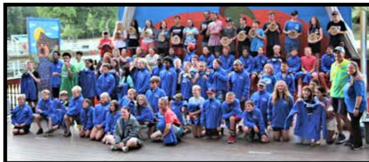
5-Year Jackets, 10-Year Plaques, 15 Year “Golden Slushie Passes” & more will be presented at the 25th Anniversary Old-Timer’s Ceremony, 8/5 @ 7pm at the Lakeside Amphitheater